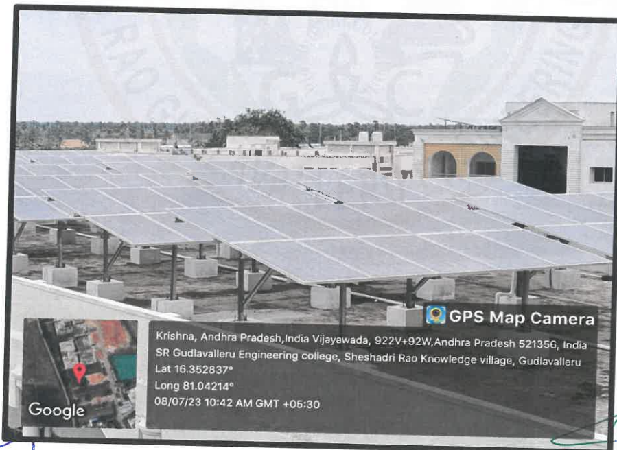
Roof top solar panels