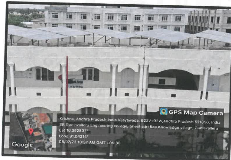
Roof top solar panels